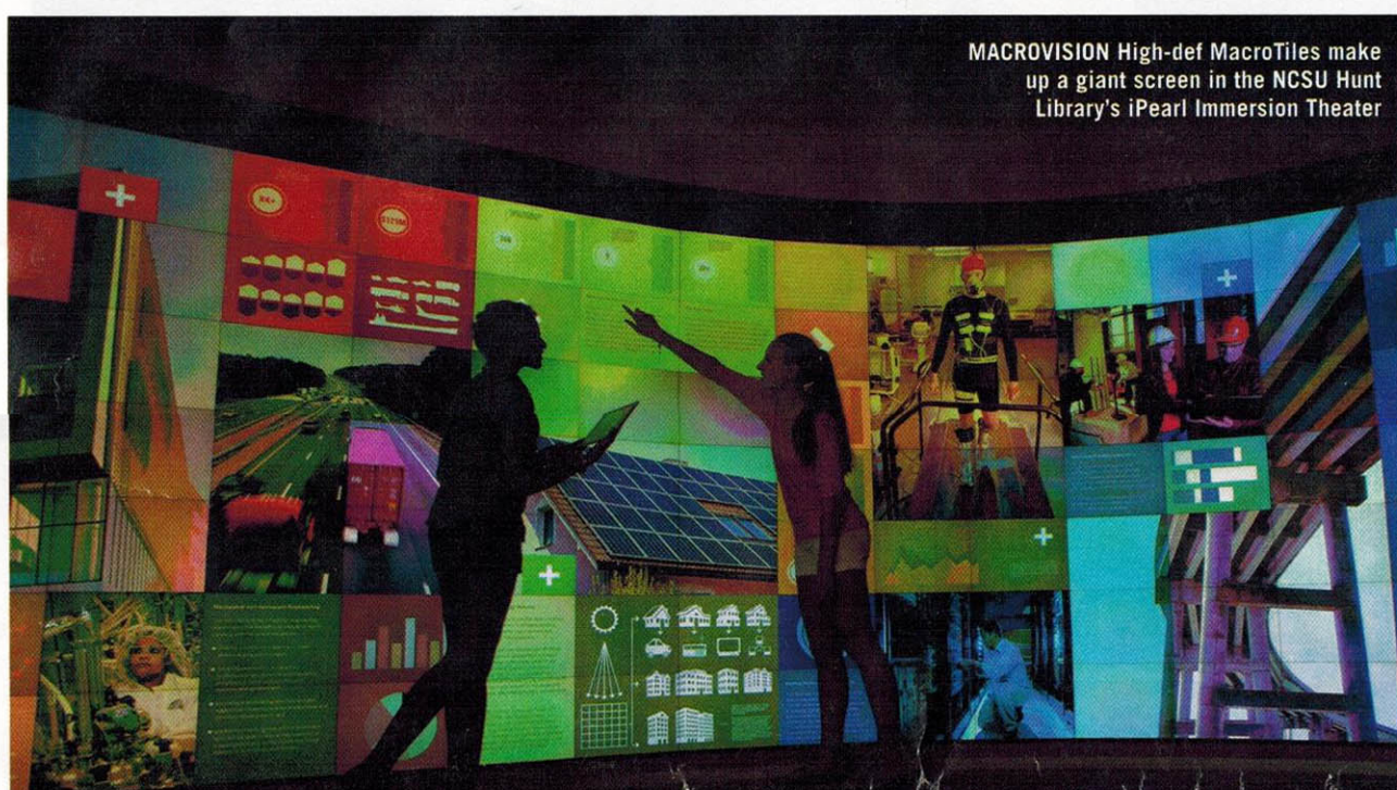
MACROVISION High-def MacroTiles make up a giant screen in the NCSU Hunt Library's iPearl Immersion Theater

The Hottest Furniture, Shelving, Carpeting, Tech Tools, and More