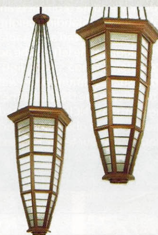
THREE-STORY-HIGH PENDANTS CREATE A STRIKING IMAGE, P. 17

GREAT PRODUCTS AND FURNISHINGS FOR YOUR LIBRARY