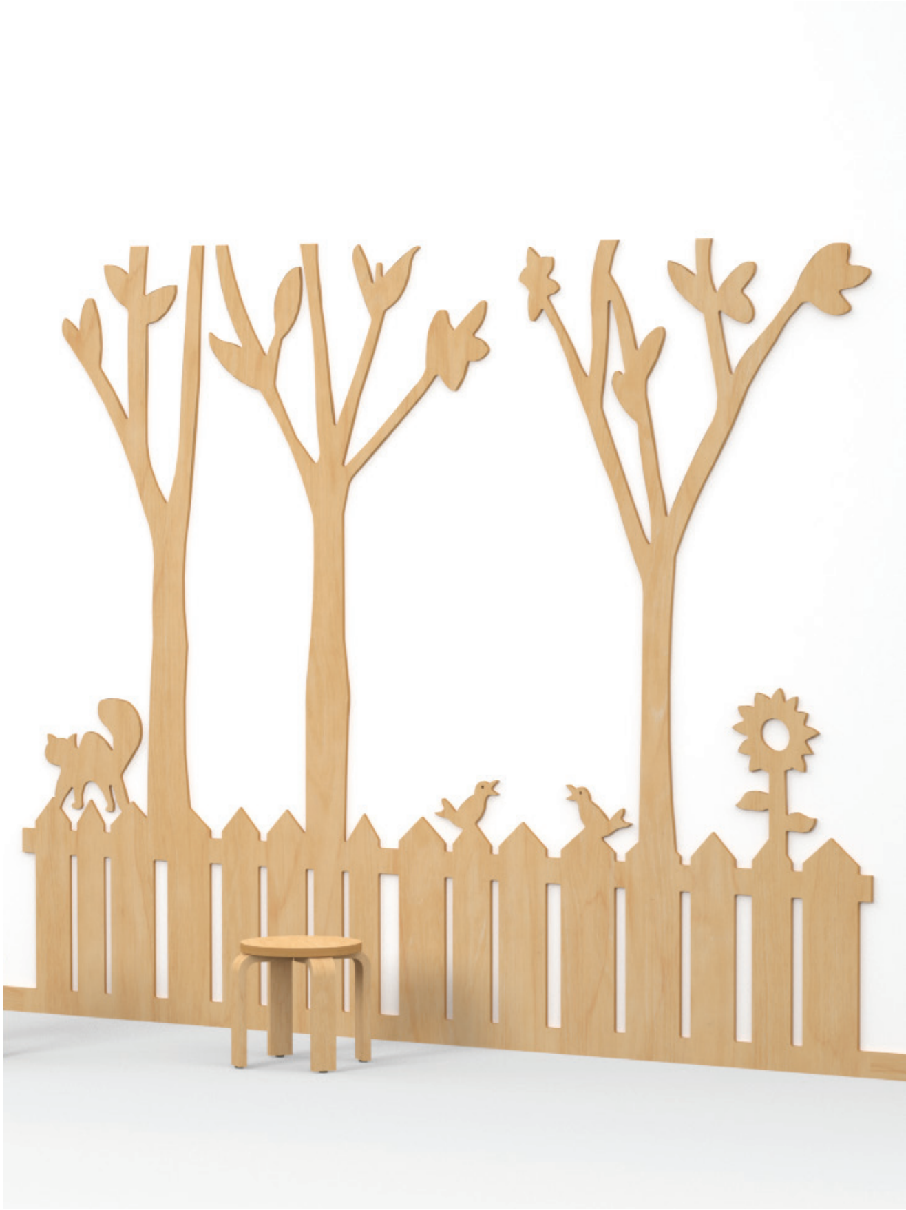
Grove Tree with Fence Appliqué