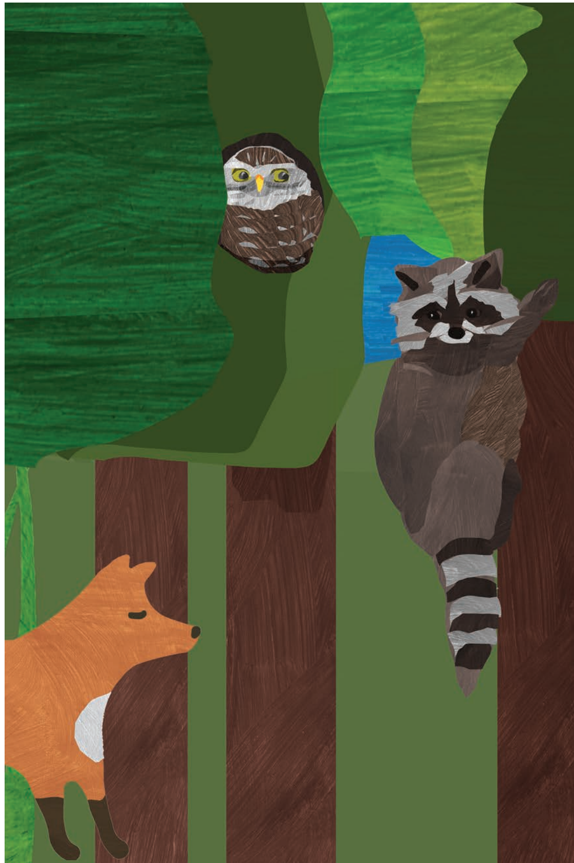
Detail of The Woodlands Wall Mural