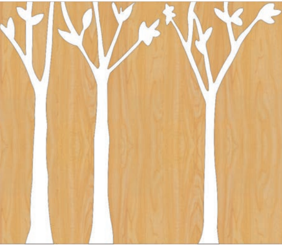
Grove Tree Appliqués - InRelief