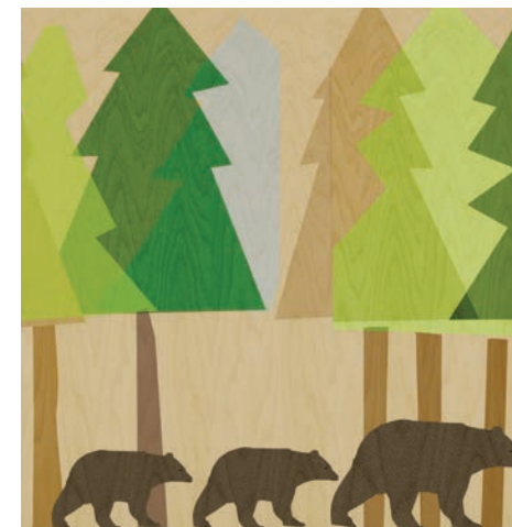
Mama Bear and her 2 cubs