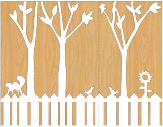
Grove Tree with Fence - InRelief