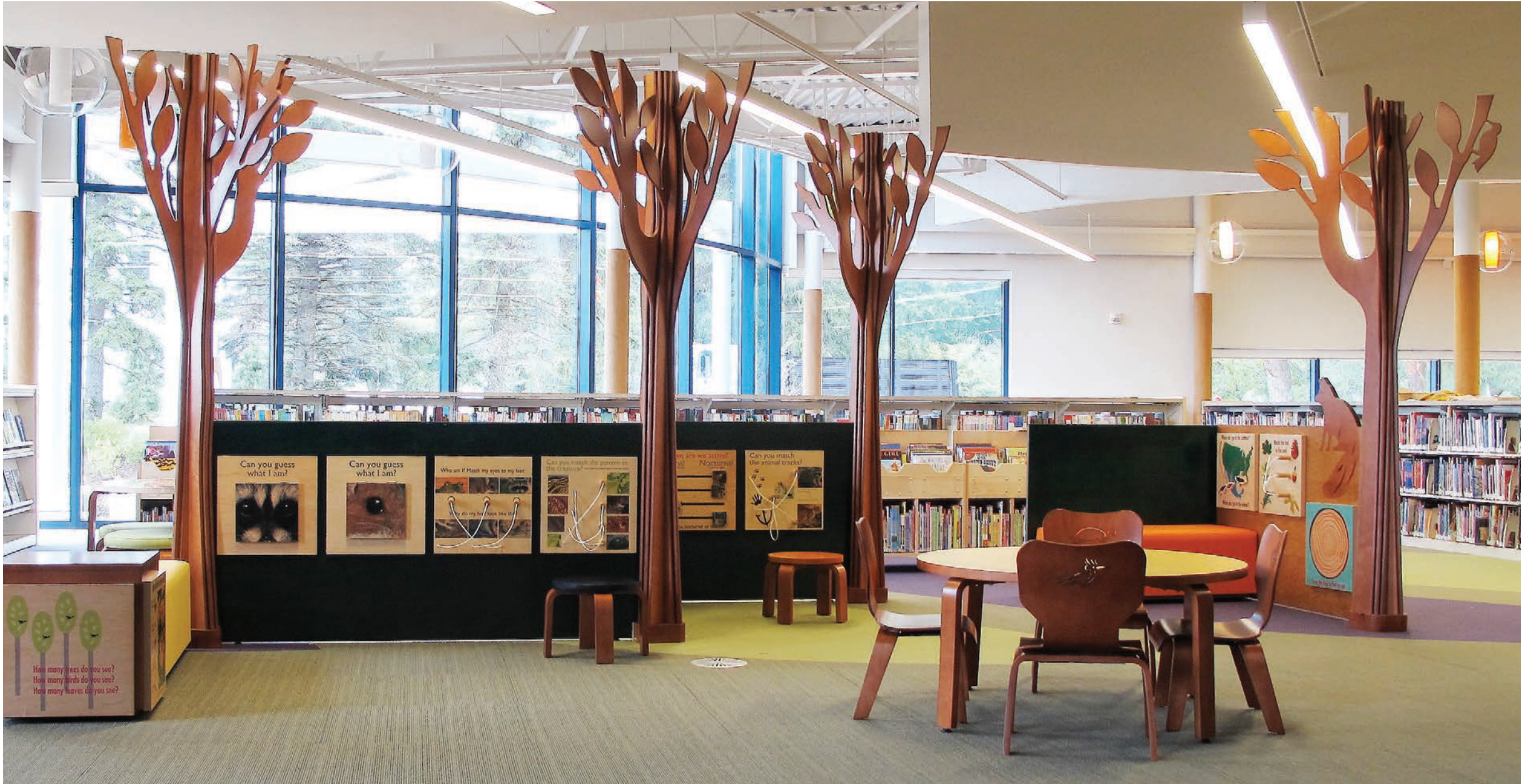
Early Literacy area with Trees, Learning Panels, Plover Table, Plover Chairs and Plover Stools.