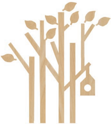
Aspen Trees with Birdhouse Appliqués