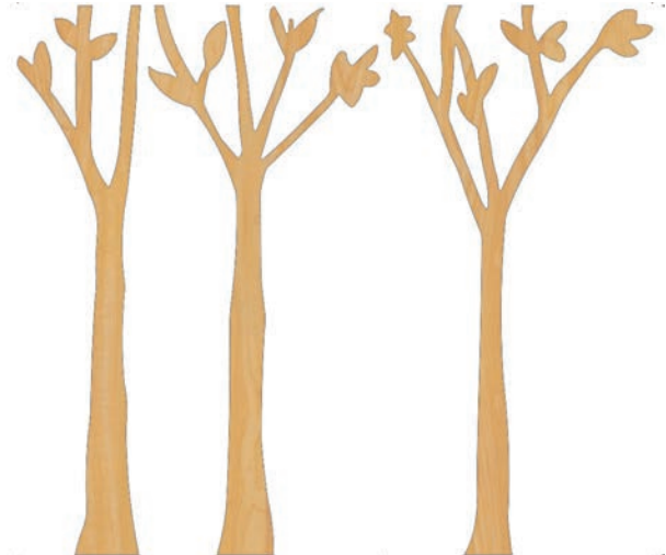
Grove Tree Appliqués

Dimensional and tactile our Tree Appliqués are timeless in look. They brighten up any interior.