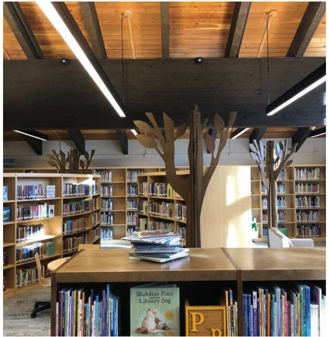
A forest of Freestanding Trees integrate into the shelving end panels in the children's room.