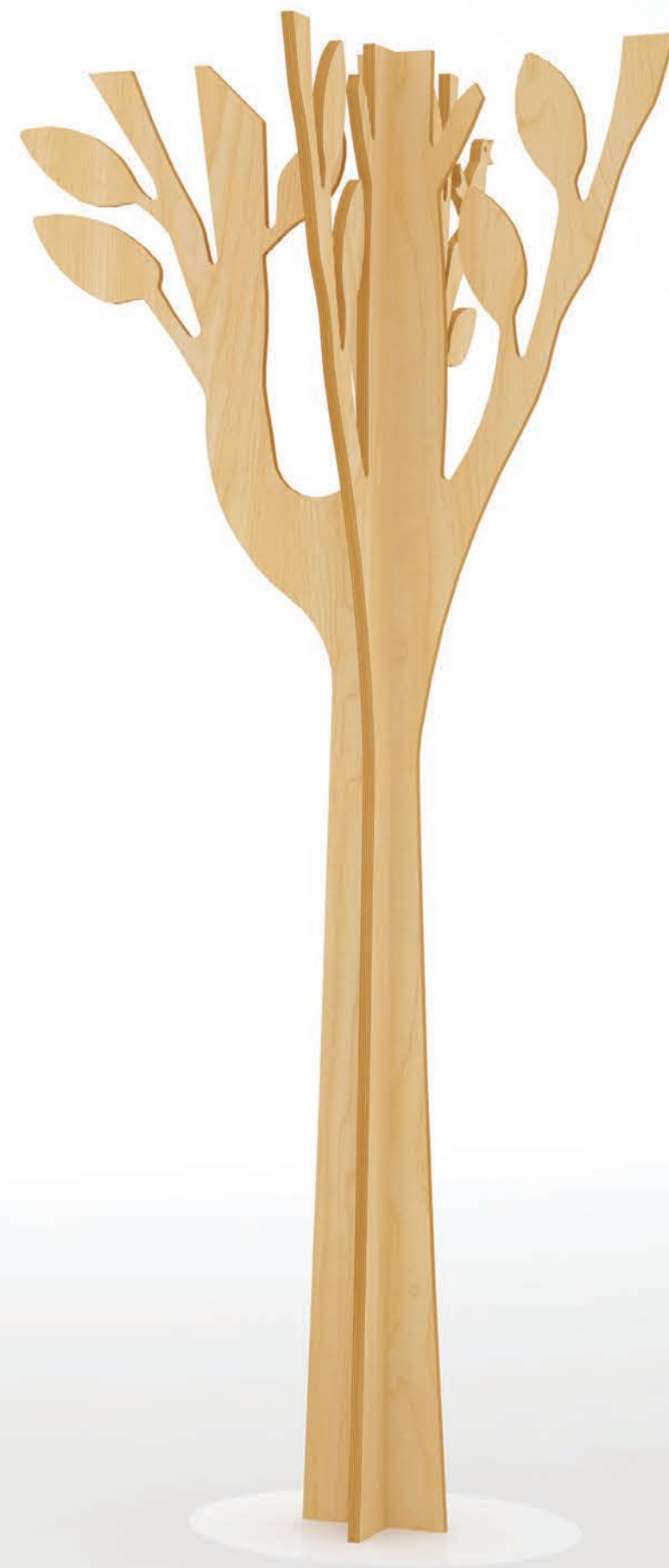
Pictured: Aspen, Topiary and Arbor Tree Collection