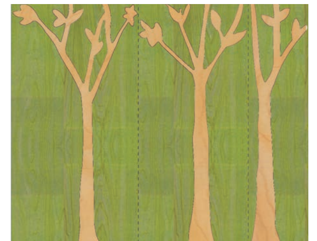
Grove Trees - Autumn